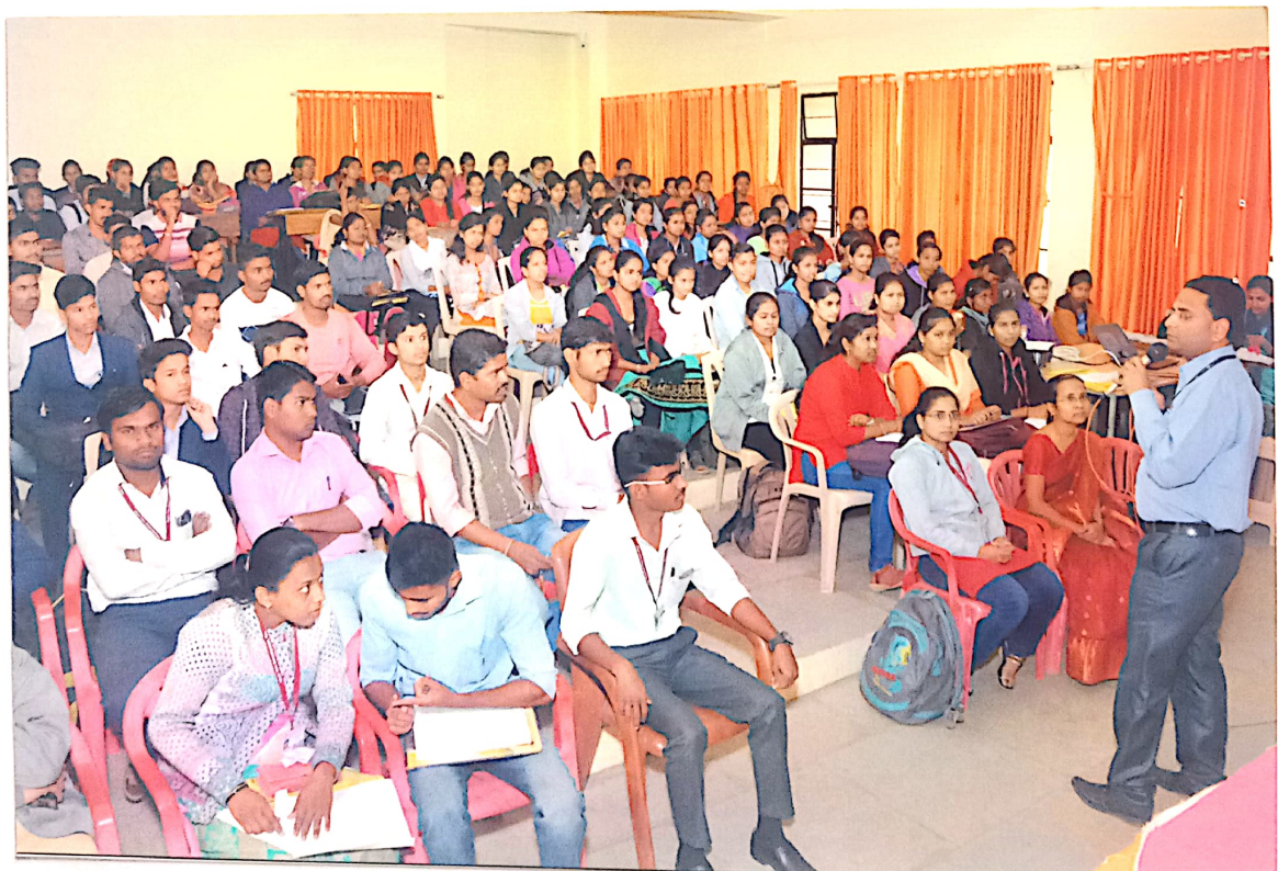
Students during Guest Lecture on Computer Accounting Tally Package.